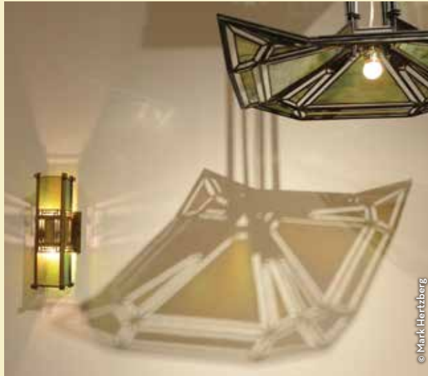
Wall sconces and a hanging lamp from the Heath House (1905) in Buffalo, N.Y. are on display.

It is a challenge for museum curators to decide how to present Frank Lloyd Wright's career for people well versed in his work as well as for people who may be exposed to his designs for the first time. The Milwaukee Art Museum celebrates his work with drawings and artifacts related to his legendary Wasmuth Portfolio of 1910-11. The exhibition, "Frank Lloyd Wright: Buildings for the Prairie," opened July 28 and runs through October 15.