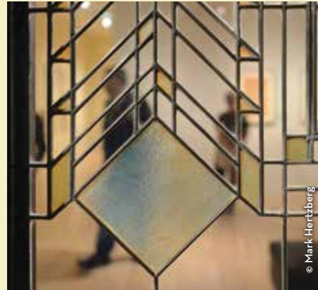
One of the leaded glass cabinet doors for the Heath House is also on display.